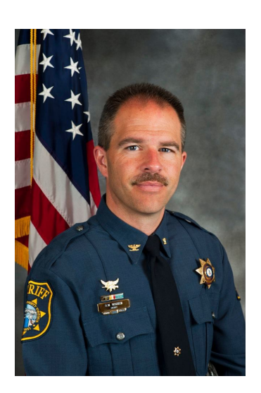
Sheriff Darrell W. Warren Jr.

The Gloucester County Sheriff's Office is a full service agency dedicated to ensuring public safety for all citizens and visitors, as well as the protection of all property in Gloucester County, Virginia.