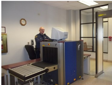
Deputy Dowdy monitoring the main entrance of courthouse.

These deputies are also responsible for delivery of all legal process documents. These documents are delivered personally to each party of interest throughout the entire county. The deputies in this division processed and served legal process of more than thirty thousand individual documents.