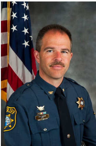
Sheriff Darrell W. Warren, Jr.

The Gloucester County Sheriff's Office is a full service agency dedicated to ensuring the public safety for all citizens and visitors, as well as the protection of all property in Gloucester County, Virginia.