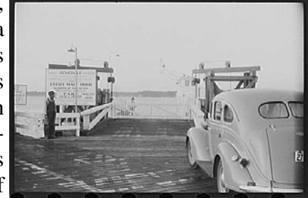
Gloucester Point Ferry Terminal—1940

via Washington, Yorktown & Virginia identifies Beach. Federal Route 17 as of the one main of arteries North-South travel. It lists over 30 points of interest along the route. The guide also