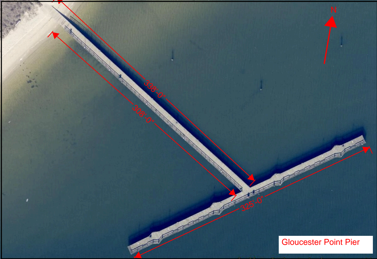
Gloucester Point Pier