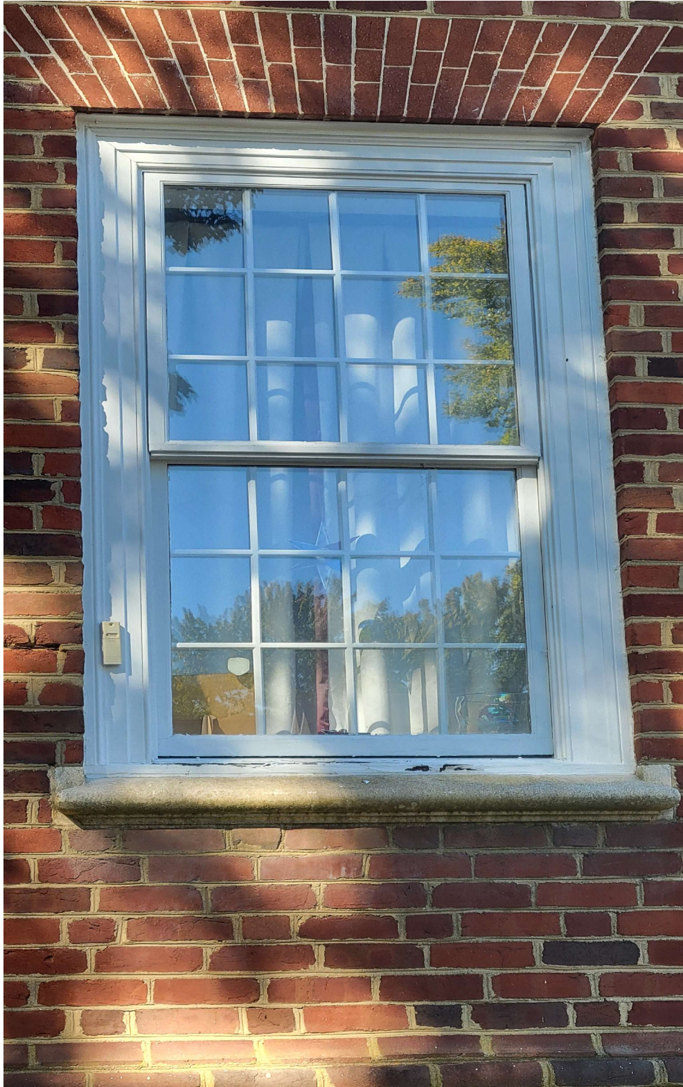
Building 2 Window